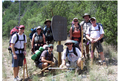
Trail Work, Cedar Bench Wilderness

Cedar Bench Wilderness was established in 1984 and has a total of 14,950 acres with over 30 miles of trail allowing solitude and wildlife observation. Cedar Bench falls along a broad northwest-southeast trending ridge or "bench," and from this elevated perch visitors can glimpse stunning views of the desert's vivid colors. The Wilderness occupies the dividing line between the Verde River and the Agua Fria River drainages, with the Wild & Scenic Verde River forming a portion of its eastern boundary. The Verde supports many species of wildlife that are endangered or of special interest to biologists. Elevations in the area range between 4,500 feet and 6,700 feet with a primary vegetative cover of chaparral and lesser amounts of pinion pine and Utah juniper. In the lower reaches along the river, saguaro cactus can be found hiding on south facing hillsides.