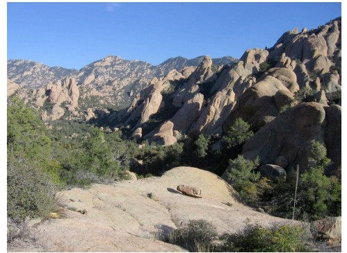
Holdout Canyon, Santa Teresa Wilderness

Established in 1984, this 26,780 acres wilderness, located in the Coronado National Forest, lies between Aravaipa Canyon Wilderness and the San Carlos Apache Indian Reservation, and adjoins the North Santa Teresa Wilderness. One of the 'Sky Islands' mountain ranges of southern Arizona, the Santa Teresa's are little visited which means the trails are obscure, the wildlife is plentiful, and the solitude is bountiful. Just getting to this area in a vehicle can prove difficult!