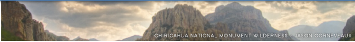
CHIRICAHUA NATIONAL MONUMENT WILDERNESS

PROTECTING ARIZONA'S WILD LANDS & WATERS SINCE 1979