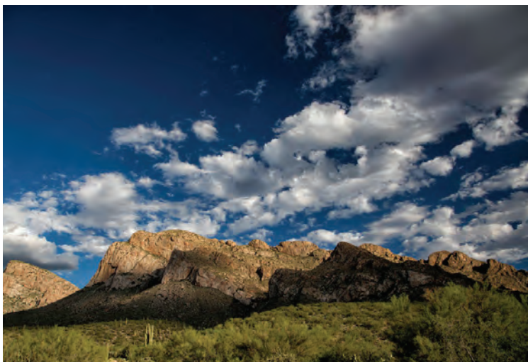
PUSCH RIDGE WILDERNESS © VANESSA DAVIS